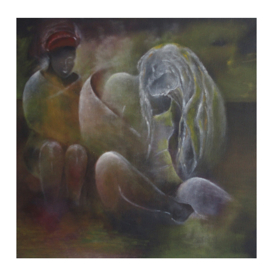
Nex to each other \cdot\,2018\cdot Oil on canvas \cdot\,30 x 30 cm