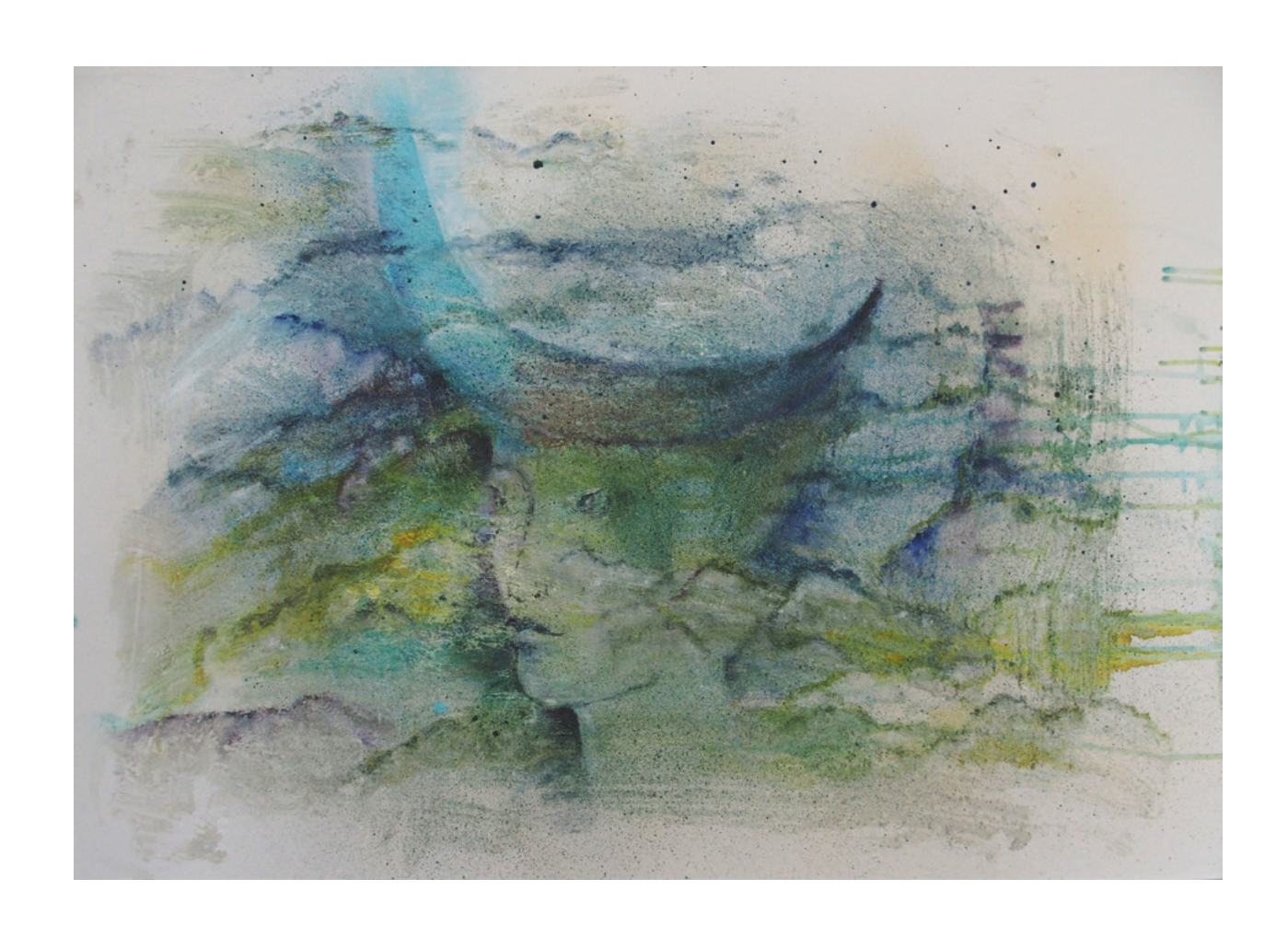
In the clouds \cdot 2018 \cdot Marble flour, oil on canvas \cdot 40 x 55 cm