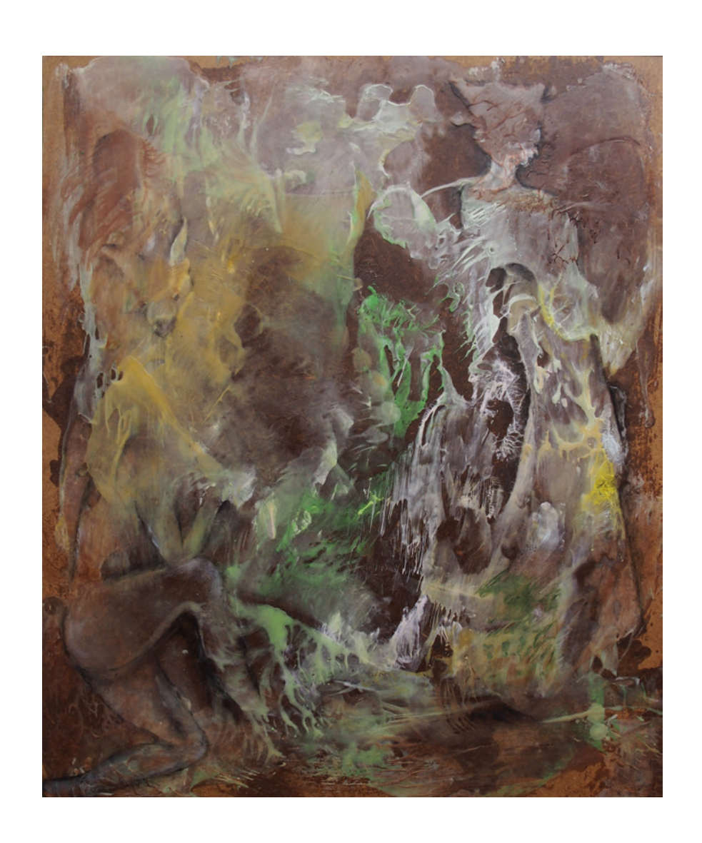
Witches \cdot 2020 \cdot Encaustics, oil on carton \cdot 60 x 50 cm