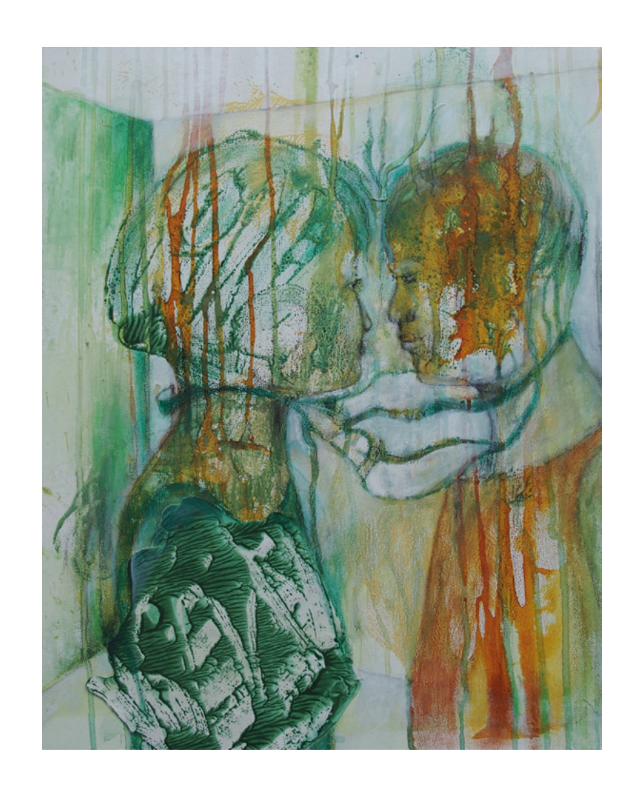
Mask? No question! Oil on canvas 50 x 40 cm