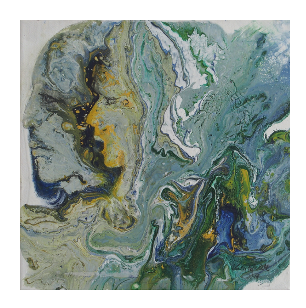
The two of us \cdot 2019 \cdot Acrylic pouring on canvas \cdot 40 x 40 cm