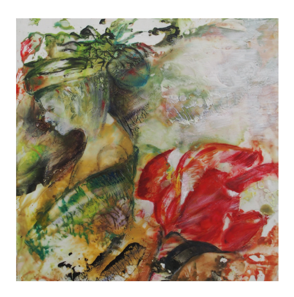
Well protected \cdot\,2020\cdot \text{Encaustics}, oil on canvas \cdot\,40 x 40 cm