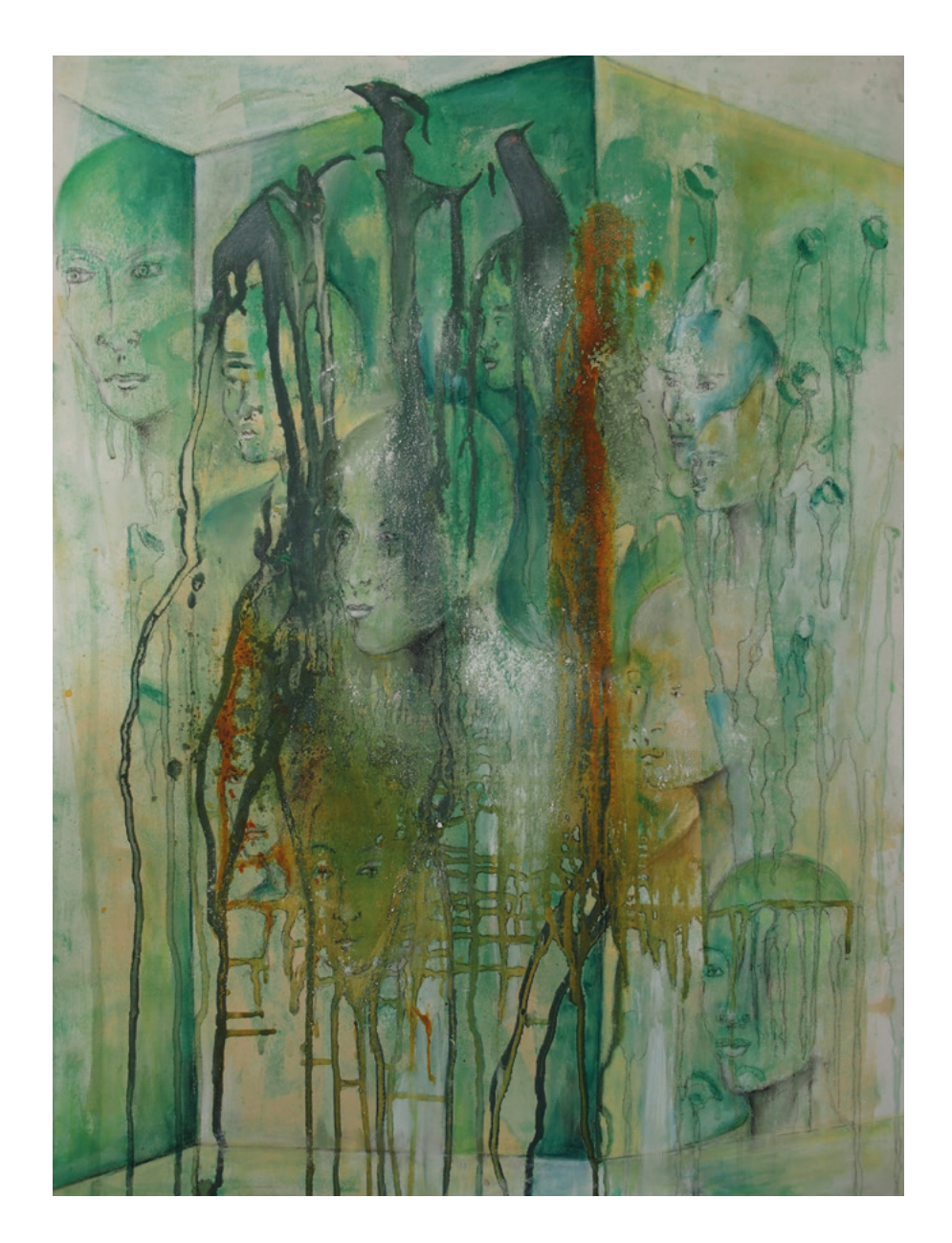
Corona Blues \cdot 2020 \cdot Oil on canvas \cdot 80 x 60 cm