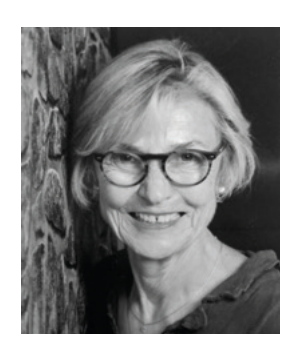
Biography 1941 Born in Eberswalde