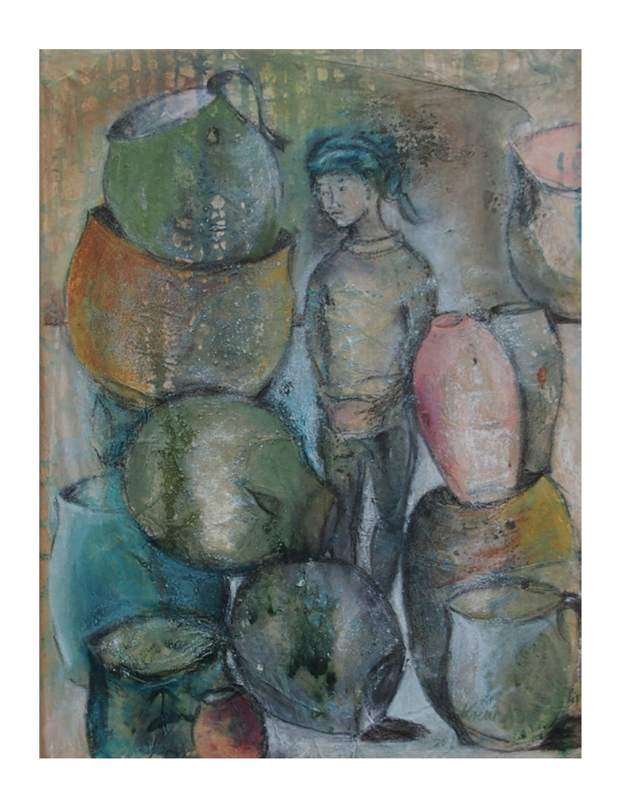
Too many pots! \cdot 2020 \cdot Mixed material on canvas \cdot 40 x 30 cm