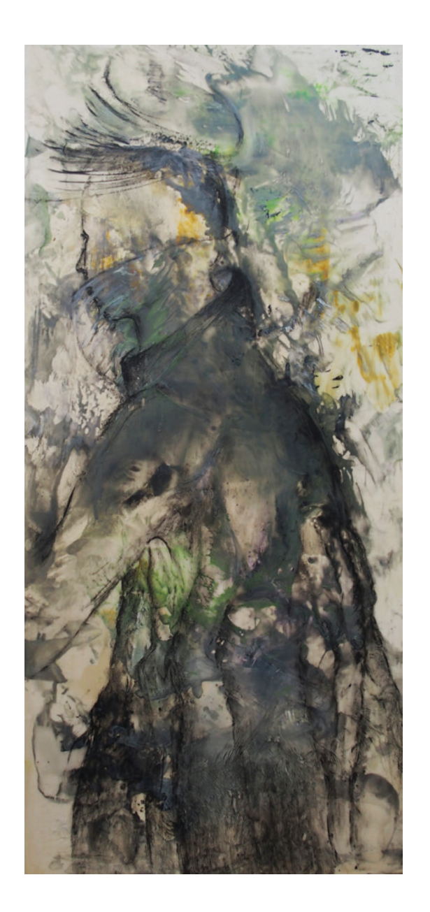
Wax Boy \cdot 2020 \cdot Encaustics, oil on wood \cdot 90 x 43 cm