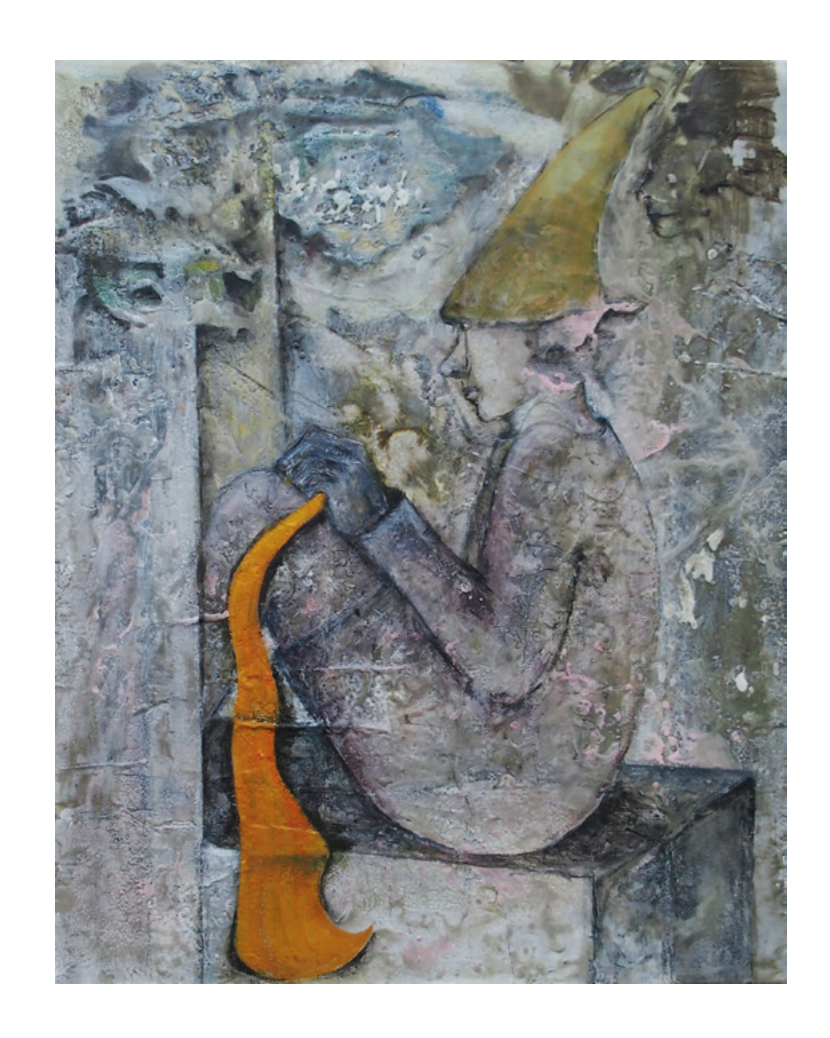
Troll \cdot 2020 \cdot Encaustics, oil on canvas \cdot 50 x 40 cm