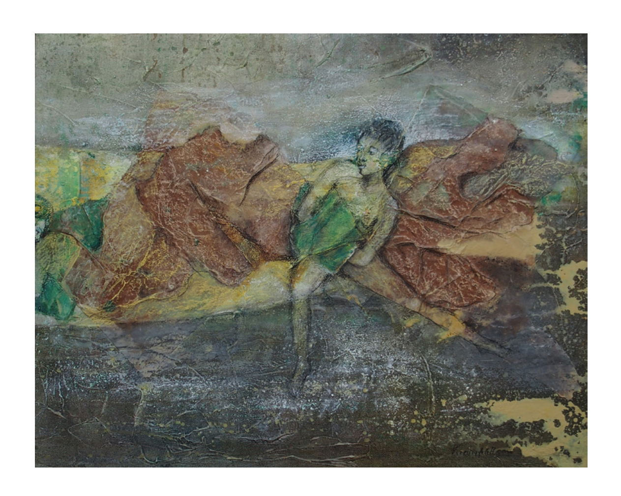
Let go \cdot 2020 \cdot Mixed material on canvas \cdot 40 x 50 cm