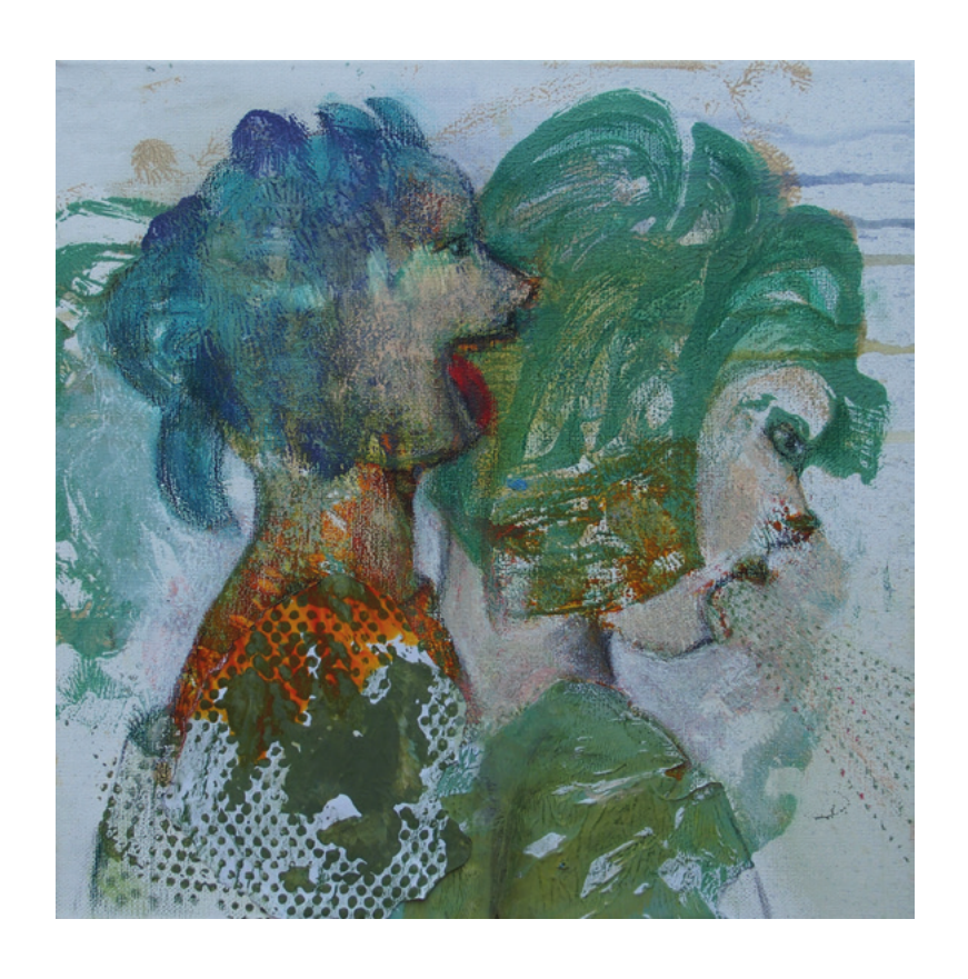
Yuck · 2020 · Decal<br/>comania, oil on canvas · 30 x 30 cm