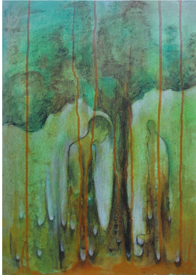
Parting · 2019 · Various techniques on canvas · 45 x 32 cm