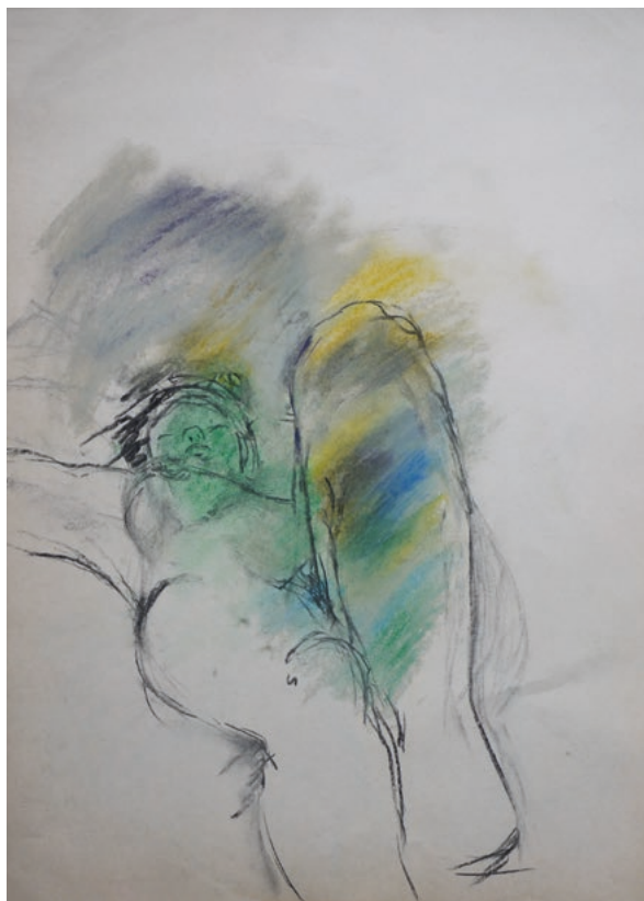
Nude 1 · 2014