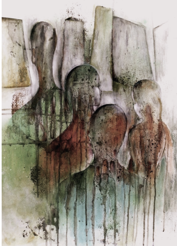
Hall of mirrors · 2019 · Various techniques on canvas · 70 x 50 cm