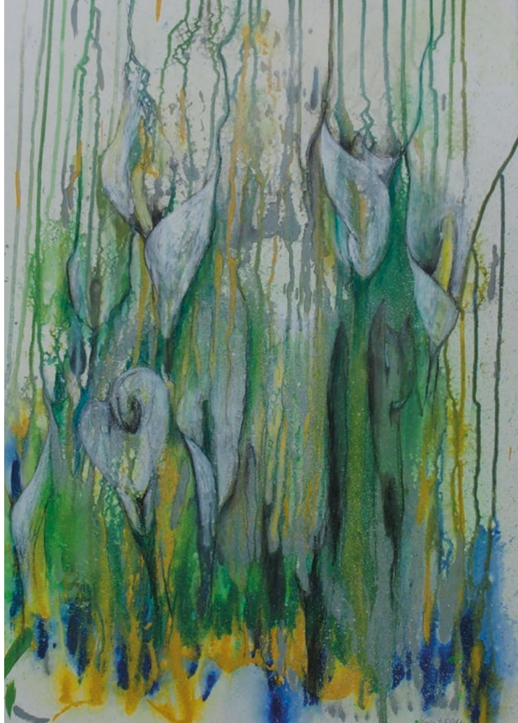
Callas · 2019 · Various techniques on canvas · 70 x 50 cm