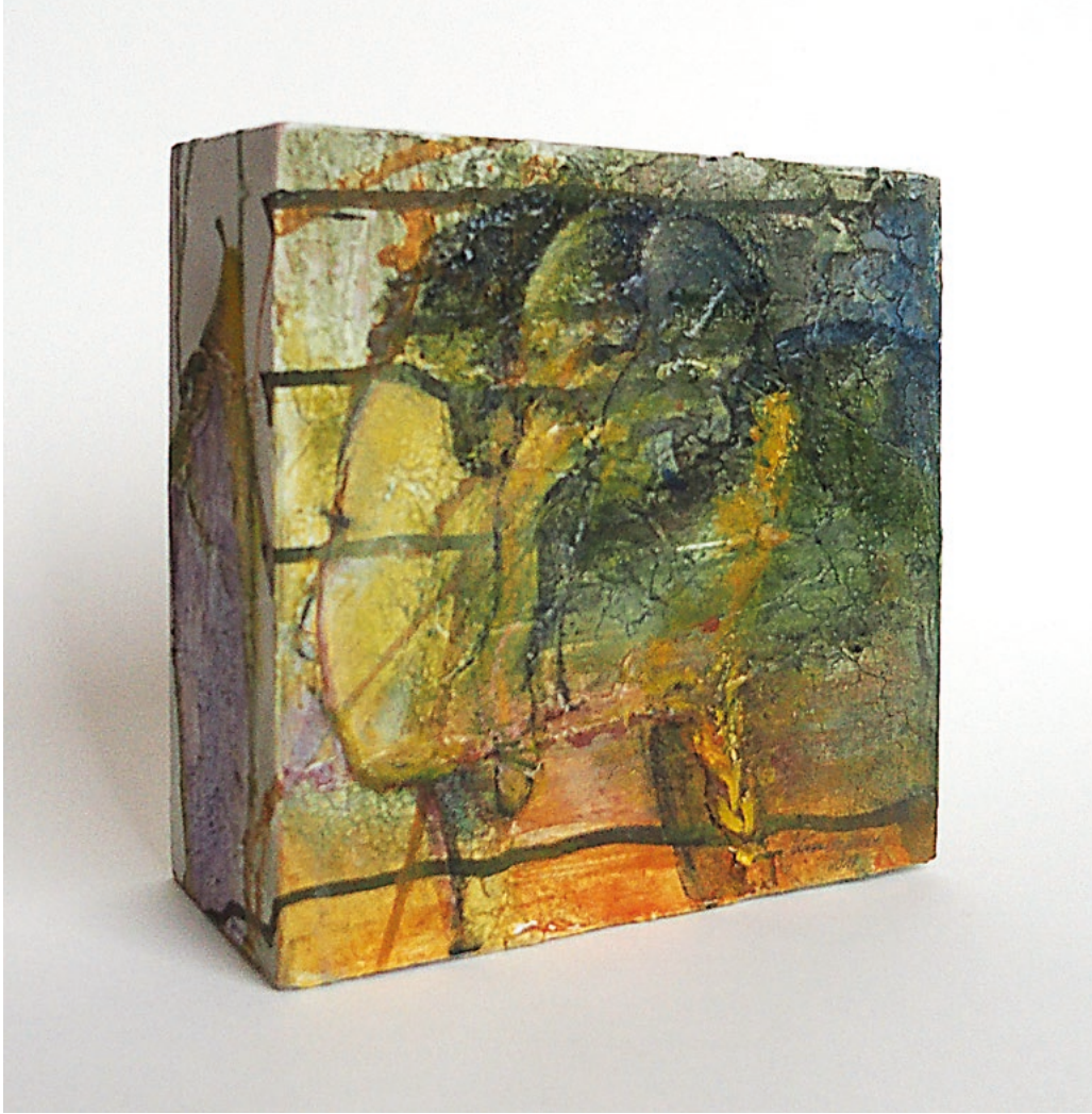
Viewing angle 3 · 2019 · Various techniques on wood · each 15 x 15 x 6 cm