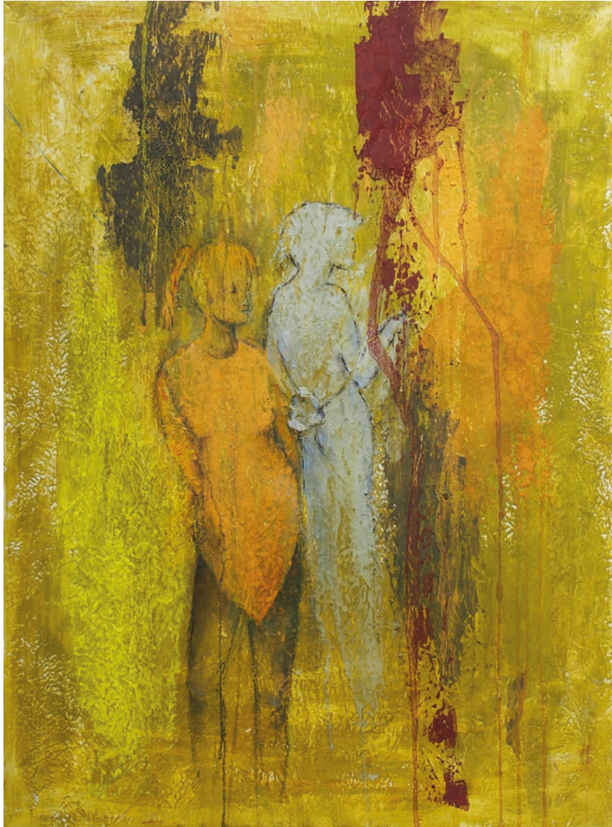
Meeting place · 2019 · Various techniques on canvas · 80 x 58 cm