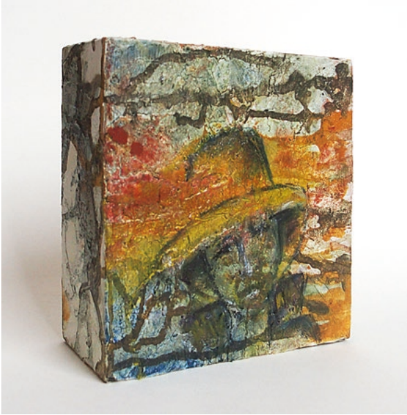
Viewing angle 1 · 2019