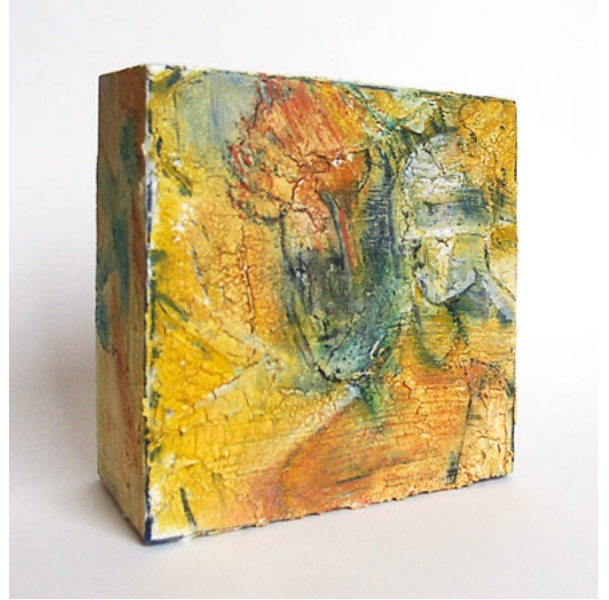
Viewing angle 2 · 2019