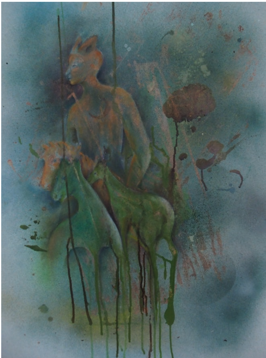
On the way · 2018 · Various techniques on cardboard · 80 x 60 cm