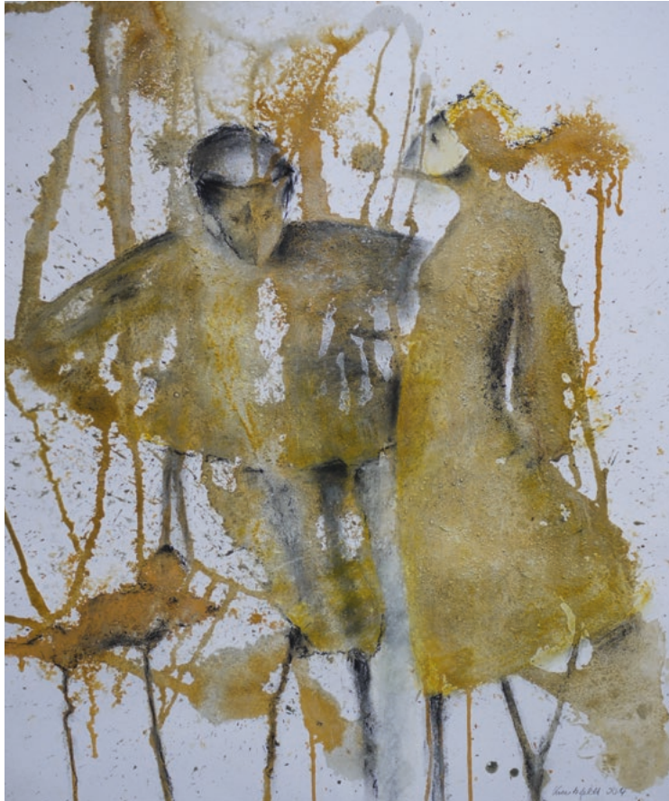
On stilts · 2014 · Various techniques on cardboard · 60 x 50 cm