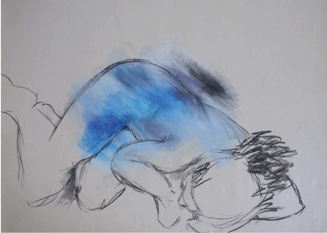
Nude 3 · 2014 · Grafite, charcoal on paper · each approx. 50 x 36 cm