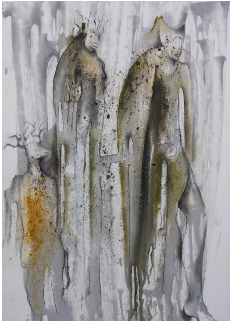
Pause · 2015 · Various techniques on cardboard · 70 x 50 cm