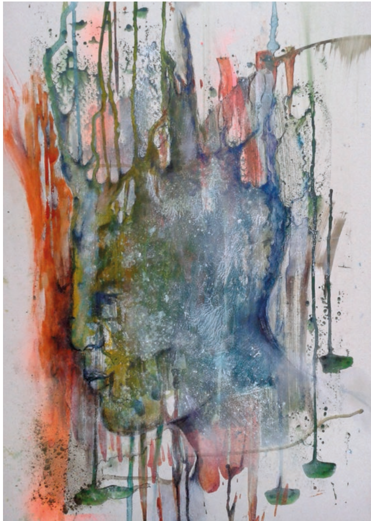
Rank growth · 2018 · Various techniques on cardboard · 70 x 50 cm